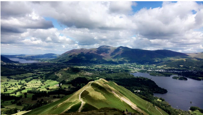
View from Catbells, The Lake District