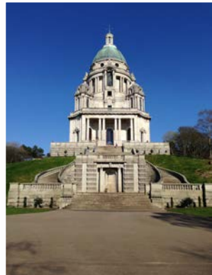
Lancaster canal (left) and The Ashton Memorial (right)