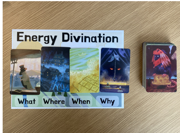
Figure 1: Energy Divination is a quick visual prompt game about using only visual information to predict (or forecast) energy futures. It encourages an alternative approach and perspective to the data-centric thinking that happens in energy research and ICT interventions.

Building on our speculative design ContextSense , a headset that connects Energy Managers to signals that are not perceivable to humans [3], this activity brings practical and gameful elements to the concept of exploring different approaches for visual communication and telling energy stories. The intention behind this design is to play with the normative ways in which data is presented and used to forecast or predict systems behaviours through different kinds of story telling.