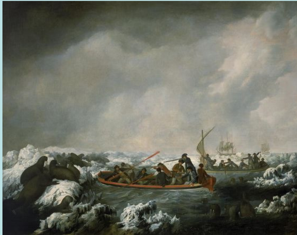
'A party from His Majesty's ship Resolution shooting sea-horses...1778' (BHC4212) by John Weber.