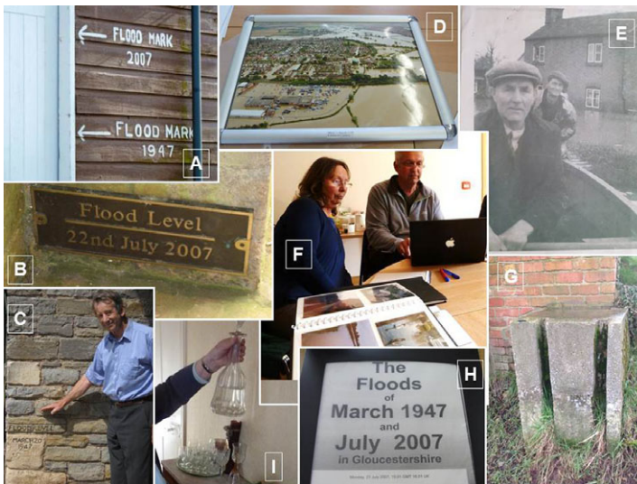
Figure 1 Forms of flood materialisation: collective and personal settings. A/B, epigraphic marking of varying persistence; C, remembering personal flood levels; D, July 2007 'a weekend in history'; E, historic 1947 flood photographs; F/H, sharing 'flood albums'; G, historic community protection measures; I, preserved flood water

Respondents across all Settings indicated that diverse methods of materialising and memorialising floods were used during and after the 2007 events to capture experiences, and to differentiate 'routine' from 'exceptional' flooding. Epigraphic marking of maximum 2007 levels, sometimes relative to historic 1947 floods, took place in private and public settings (e.g. a church (Setting 1), tea rooms (Setting 1) and garages (Settings 1, 2)) on individual or group initiative (Figure 1A–C). Flood materialisation also occurred through more traditional archiving – in personal, family and collective 'flood albums' (Settings 1, 4; Figure 1D–F), and through oral history and reminiscence storytelling (Setting 2). 7 In one instance, a decanter of turbid 2007 floodwater was still on display in the home in 2014 – a materialisation and a memorialisation that produced 'disgust' (Figure 1I). Notably, increased use of communication technologies (social media; photo-sharing sites) expanded 'community' connections from local to regional and global (Garde-Hansen et al. 2016; Krause et al. 2012).