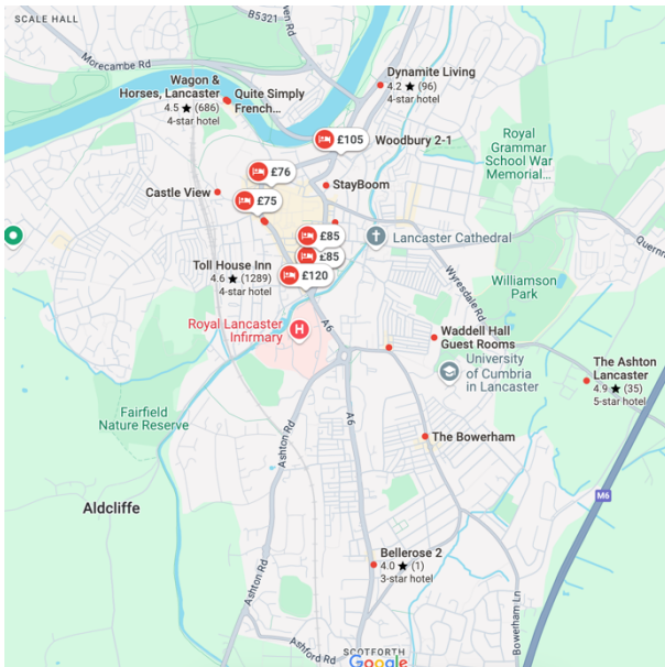
Figure 1: Hotels and inns in and around Lancaster city centre